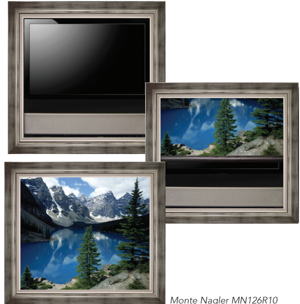
Monte Nagler MN126R10